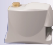
52290 Designer Cover

At the hub of this network is a single Air Techniques high-pressure oil-less compressor enabling several operators to utilize the system simultaneously and achieve maximum pressure of 160 psi.