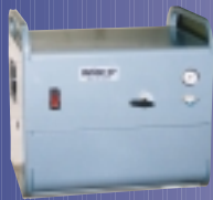
HP AirStar Compressor