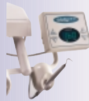
Digital Keypad and handpiece with holder

This kit allows you to mount the AirDent II CS to a standard dental unit.