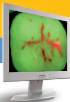
Actual image of examined tooth

Early caries detection supports today's standard of care and the philosophy of "Teeth for a lifetime". Traditional detection methods like explorer, eyesight and even X-ray are limited. The use of digital caries detection aid technology in today's dental practice is important to maintain and provide the standard of care for patients.